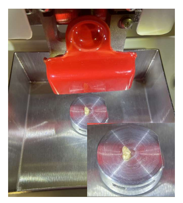
Fig.3. Tissue mounted using cyanoacrylate adhesive ready for slicing (red blade protector is in place, and bath would be filled with physiological buffer).

Fig.2. 63x image of the organ of Corti in a hemi-preparation. Contrast is difficult yet the location of the hair cells is clearly visible.